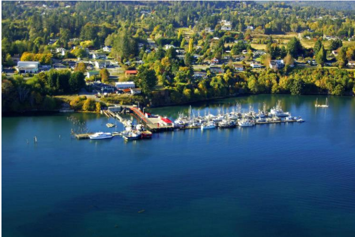
A nice shot of Sooke HA in the sun. Living the good life...