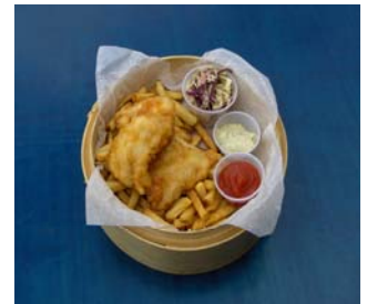
"Famous" Halibut & Chips

"Go-Fish" Seafood Emporium continues to delight visitors to the False Creek Fishermen's Wharf, serving up Vancouver's finest Fish 'n' Chips. They offer a wide variety of grilled Seafood and an inviting selection of Homemade Soups. "Go-Fish" has partnered with the local Fishermen to create a joint brochure to promote and inform people of our spectacular facility and what we have to offer our community. These brochures are located at the Harbour office.