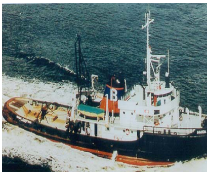
145' Tug Haida Chieftain

The steel tug "Haida Chieftain" was built in 1944. The ex-Navy vessel was a log barging tug, transporting materials up and down the BC coast.