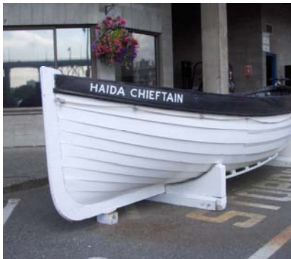
Haida Chieftain 18' Double Ender Life Boat

In the last several months we have had minimal reports of theft. We feel with the installation of the 2 new cameras we have a greater coverage area. As many of you know due to theft and vandalism, we have locked the washrooms after dusk. For after hour service please ask the security officer on duty for entrance. For any suspicious activity please call the Harbour cell 24hr/7days @ 604-834-1140